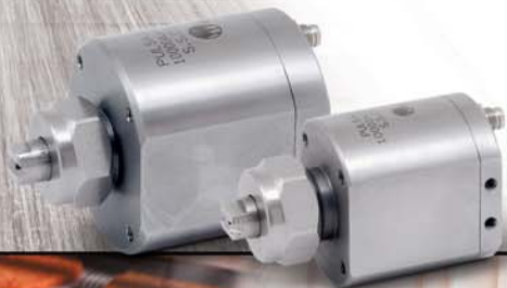
PulsaJet® Automatic Spray Nozzle